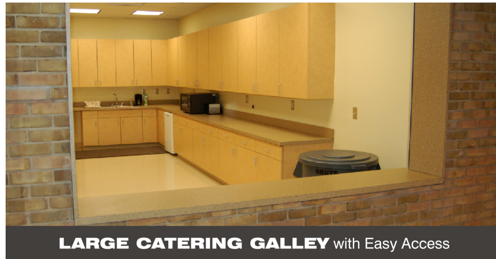
LARGE CATERING GALLEY with Easy Access

Visit Register.MiamiTwpOH.gov or call (513) 248-3727